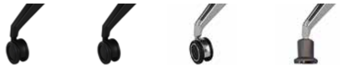
Black Dual Wheel Carpet Caster (BCC) Black Soft Wheel Caster (BHC) Chrome-Rimmed w/ Roll Control (CHRC) Black Glides for All Surfaces (BG)