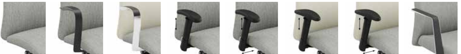
Armless (NO ARM) Black Fixed Loop (FPU1) Aluminum Fixed Loop (FAL1) Black Height Adjustable T-Arm (ABT2) Black Height & Width Adjustable T-Arm (ABT2W) Black Height Adjustable T-Arm (ABT3) Black Height & Width Adjustable T-Arm (ABT3W) Aluminum/Black Fixed Cantilever Arm (FCA1)