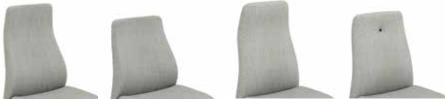
Headliner High Back (100H) Headliner Mid Back (101H) Roadie High Back (100R) Roadie Mid Back (101R)