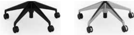
Black Nylon Base (BLK BASE) Polished Aluminum Base (ALM BASE)