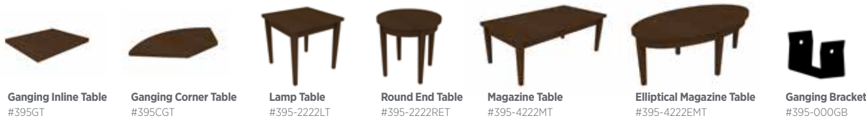
Ganging Inline Table #395GT Ganging Corner Table #395CGT Lamp Table #395-222LT Round End Table #395-222RET Magazine Table #395-422MT Elliptical Magazine Table #395-422EMT Ganging Bracket #395-000GB