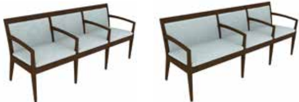
Single/Single/Single Tandem #395H3 Single/Single/Bariatric Tandem #395H3L, #395H3R (shown)