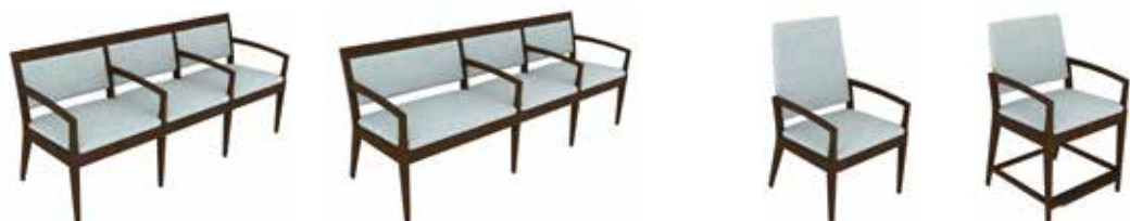
Single/Single/Single Tandem with Clean Out #395H3C Single/Single/Single Tandem with Clean Out #395H3CL, #395H3CR (shown) Patient Chair with Clean Out #397HP Hip/Easy Access Chair with Clean Out #397HH