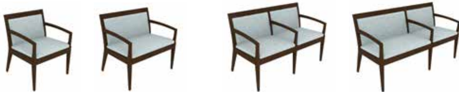
Single Seat Chair #395H Bariatric Chair #395HB Single/Single Tandem #395H2 Single/Bariatric Tandem #395H2L, #395H2R (shown)