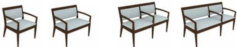
Single Seat Chair with Clean Out #395HC Bariatric Chair with Clean Out #395HBC Single/Single Tandem with Clean Out #395H2C Single/Bariatric Tandem with Clean Out #395H2CL, #395H2CR (shown)