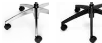
Polished Aluminum (ALM)