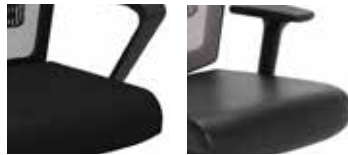
Black Fabric (SBFI)