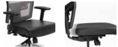
Swivel Synchro Tilt Control (SY)