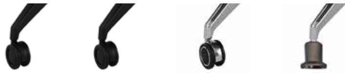
Black Dual Wheel Carpet Caster (BCC)