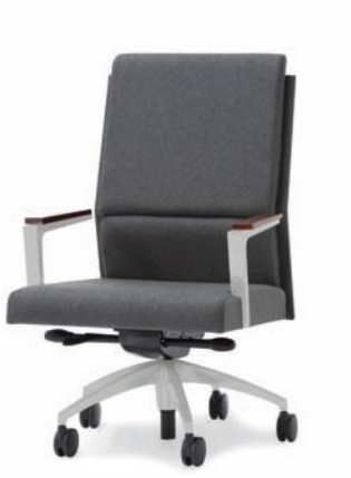
EXECUTIVE SWIVEL 424 26.25" w x 41"-44.5" h x 26" d