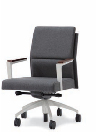
MANAGEMENT SWIVEL 422 24.25" w x 26"-29.5" h x 23.5" d