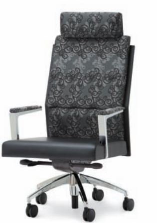
EXECUTIVE SWIVEL WITH HEADREST 425 26.25" w x 46.75"-50.25" h x 26" d