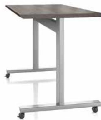
Vantage T-legs. Available on Training Tables.