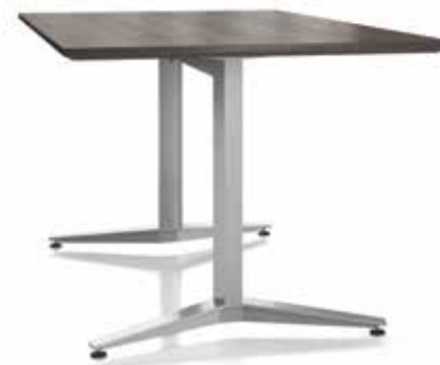
Envy Y-base. Available on Meeting Tables.