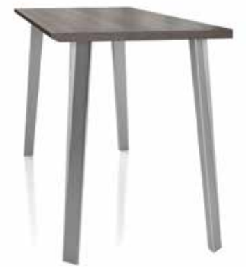
Envy Post Legs. Available on Modular Conference.