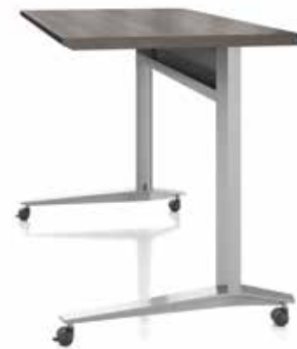
Envy C-legs. Available on Training Tables.

Start from a solid base: Aluminum powder-coated base and leg styles provide functionality and discreet design. Envy Y-bases and Envy C-bases incorporate cable routing. All legs include adjustable glides or casters.