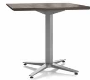
Vantage X-base. Available on Meeting Tables.